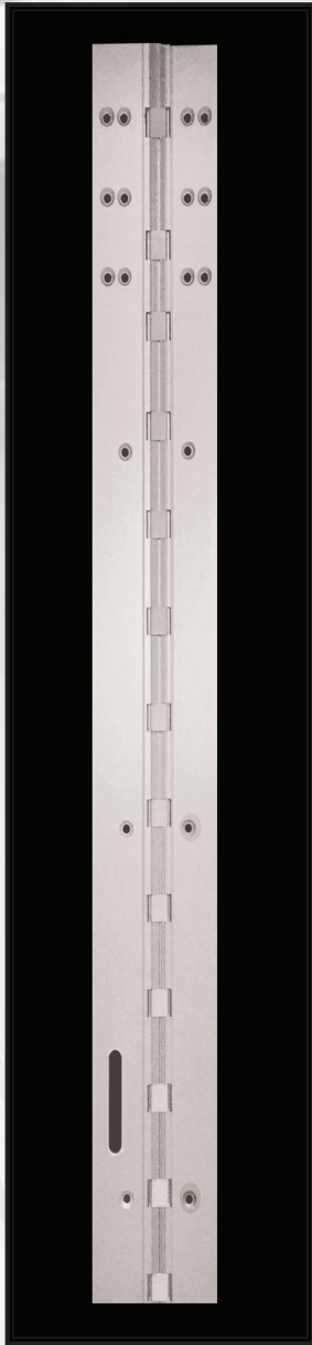
Top Half - Front View