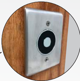
Sloped Wall Magnet