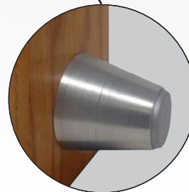
Sloped Door Armature Assembly Extended 3-3/4"

3° adjustment built in for maximum flexibility for uneven wall conditions