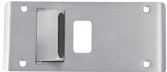
Center Hung Door - Cylindrical Latch CR4591 - 5-3/4" Frame CR4592 - 6-3/4" Frame