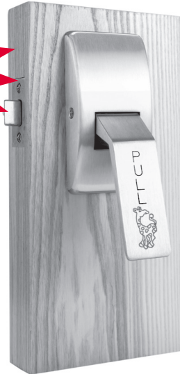
Optional Round Cover & Custom Engraving Shown

Optional "Q" Quiet Latch available - Zero decibels gained when operating the handles. Patent(s) pending.