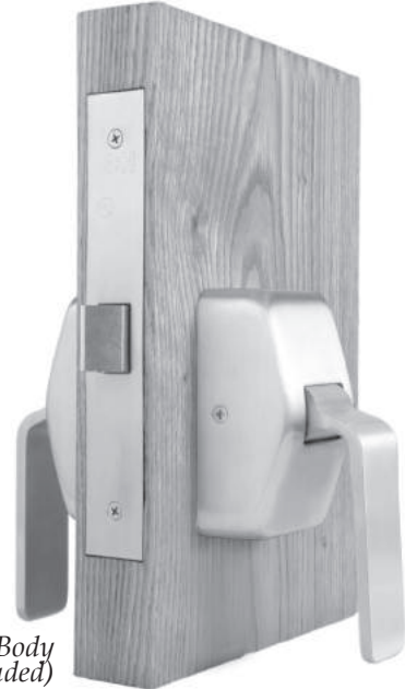
(Mortise Lock Body not included)