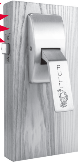
Optional Round Cover & Custom Engraving Shown

Optional "Q" Quiet Latch available - Zero decibels gained when operating the handles. Patent(s) pending.