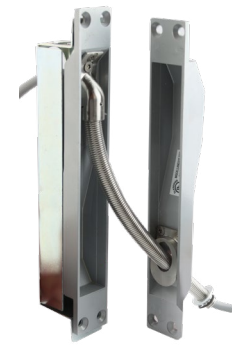
PT1000SC Swing Clear Spring Conduit Wire Housing