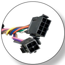
EZ Connect Molex Connectors